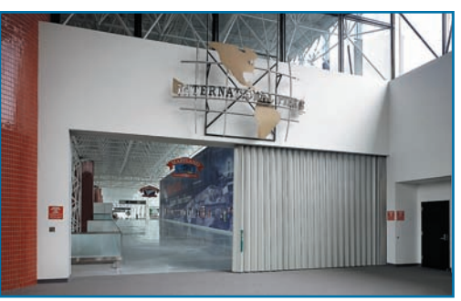
Area separation between the old and new BWI Airport terminal.

Won-Door FireGuard fire door can accommodate virtually any opening. Capable of spanning wide openings and heights up to 28 feet* – even radial configurations are possible. Best of all, the single- or bi-parting doors are installed in the open position and fold to just inches per foot behind pocket doors that you can design to blend with the surrounding architecture.