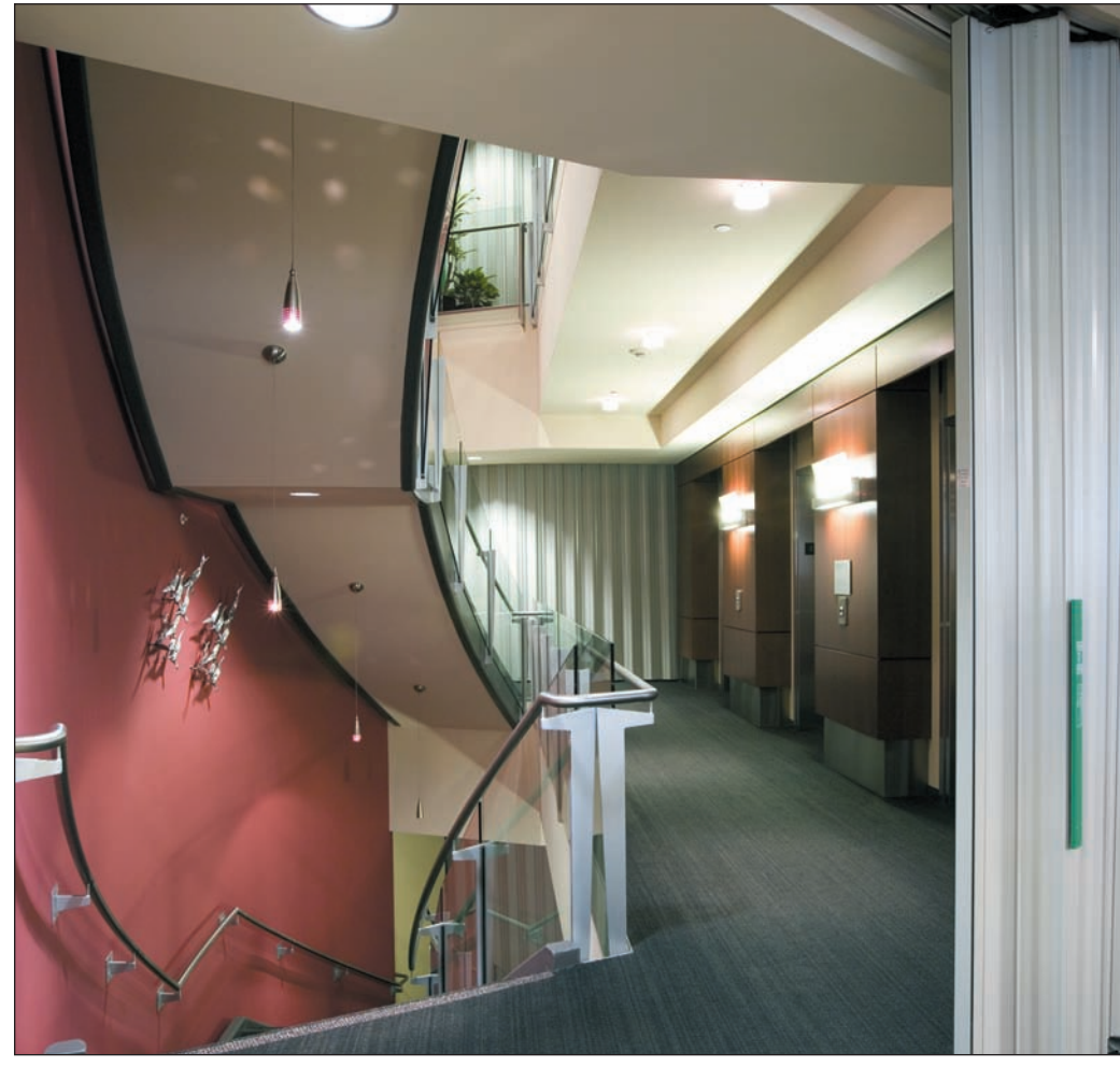
The same Won-Door FireGuard fire doors are used in this elevator lobby/stairwell to satisfy two code enclosure requirements – protection of a vertical opening as well as elevator lobby separation.

Smoke Barrier Smoke and Draft Control Vertical Exit Enclosure Separation Smoke Compartmentation Stage Proscenium Protective Vertical Opening Protective