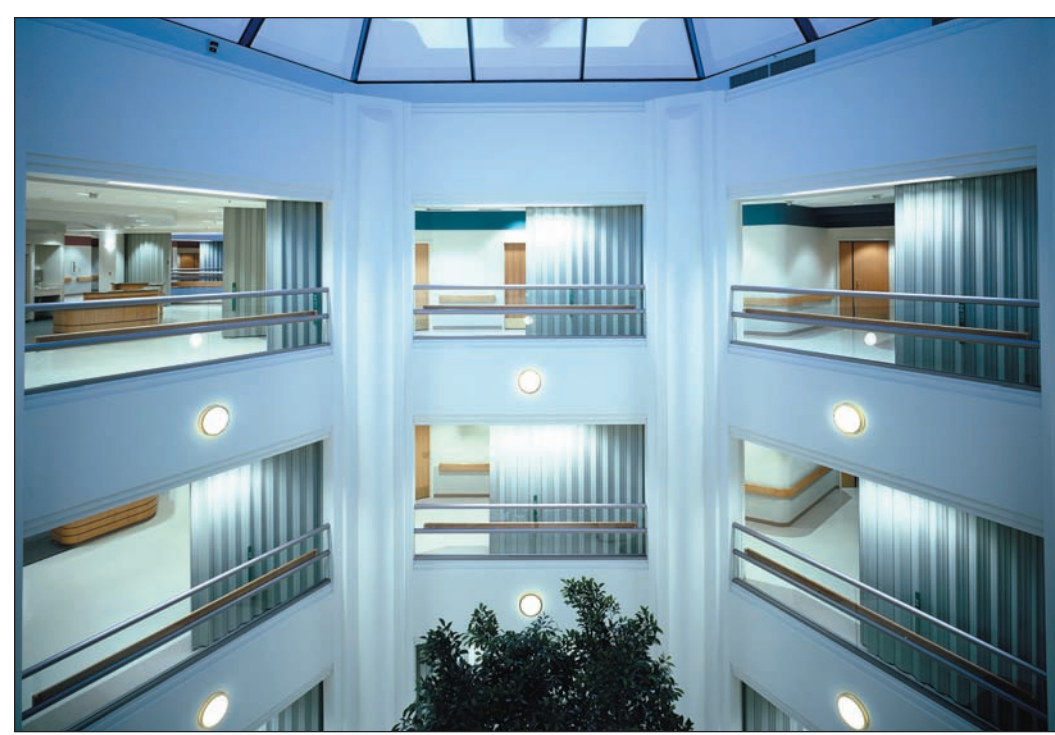
By redefining what is typically described as an "atrium" Won-Door FireGuard fire doors meet the required fire separation between adjacent spaces while eliminating costly atrium requirements such as sprinklers and smoke evacuation systems.