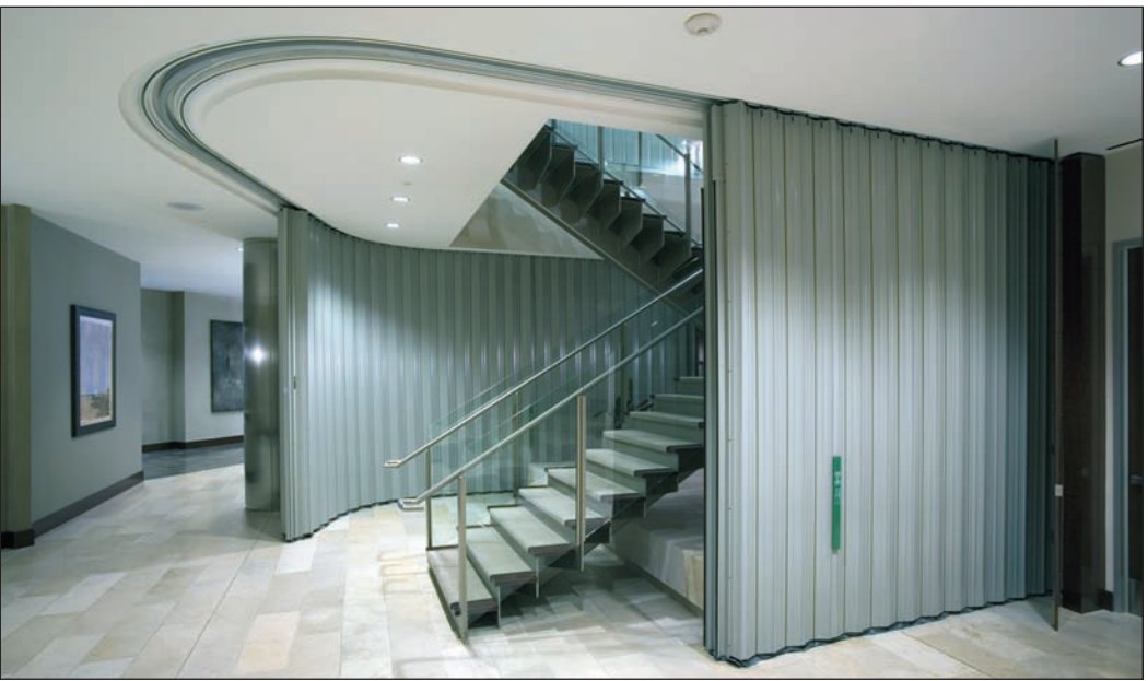
"Fire doors" are not limited to just hollow metal swings. Won-Door FireGuard fire doors are code recognized and accepted anywhere an opening protective is required.