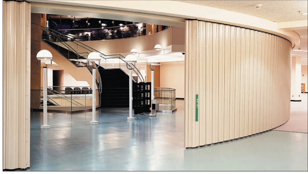
Won-Door FireGuard, the only microprocessor controlled fire door on the market, is the preferred solution for lower cost and clear openings. Some models are approved for use as an ASTM E-119 compliant moveable fire wall in non-egress openings in fire barriers.