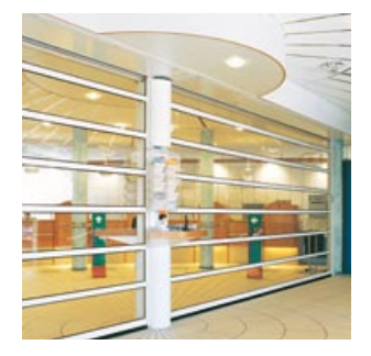
Mobile partition walls