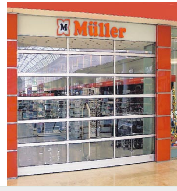
We can offer unobstructed access to shops with wide openings through utilising a sideward moveable track.

Each Butzbach Partition Wall is customized to the customer's specifications. Three different design variants are available: an all glass version, a version with horizontal profiles and a version with both vertical and horizontal profiles.