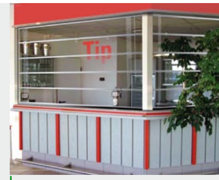
The Mobile Partition Wall is also suitable for more unusual constructions, for example use as a counter enclosure.